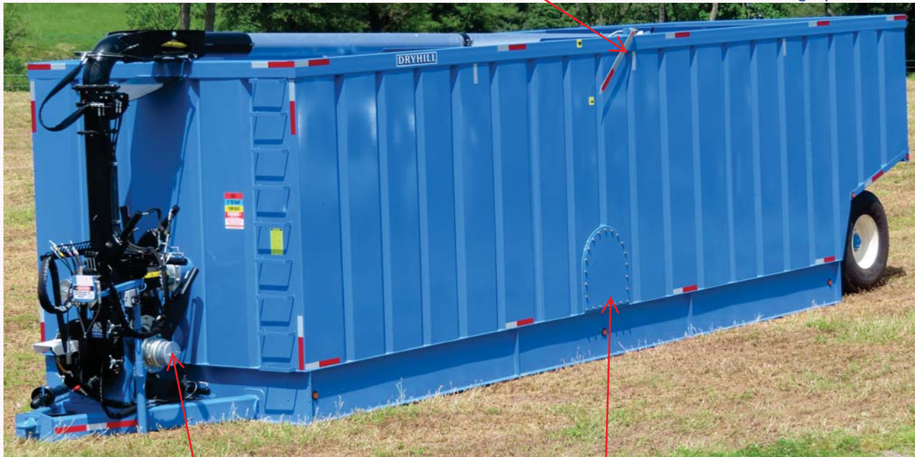
Suction Port available in RL or Ball & Ring