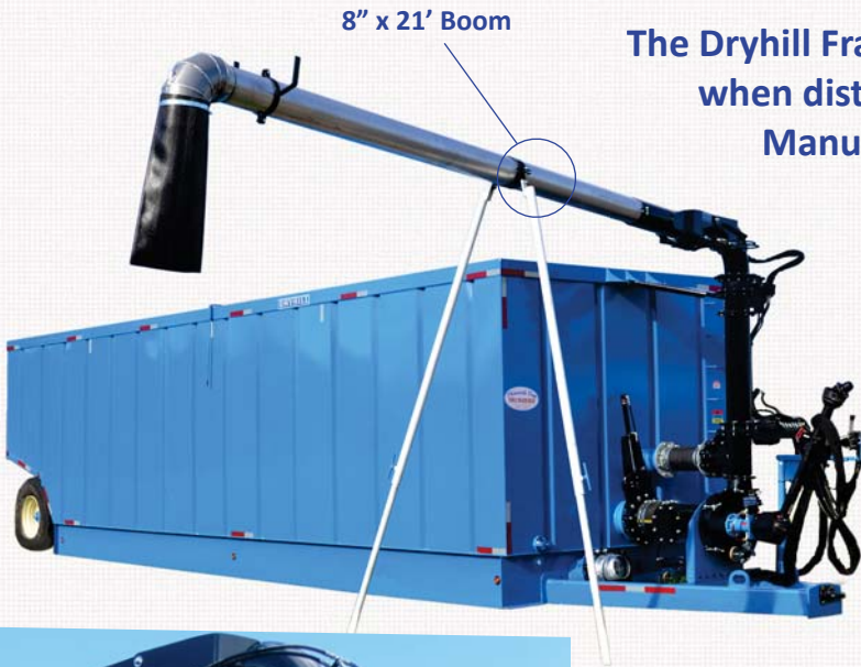
8" x 21' Boom

The Dryhill Frac Tank is an effective way to apply manure when distance is an issue & utilize Semi Tankers, Manure Tanks, or Drag Hose Application.